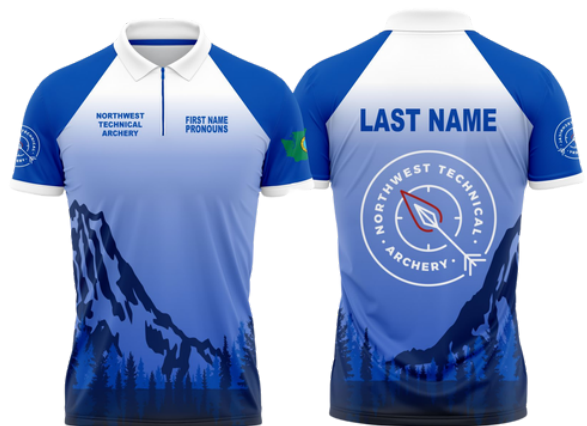
6 colors available