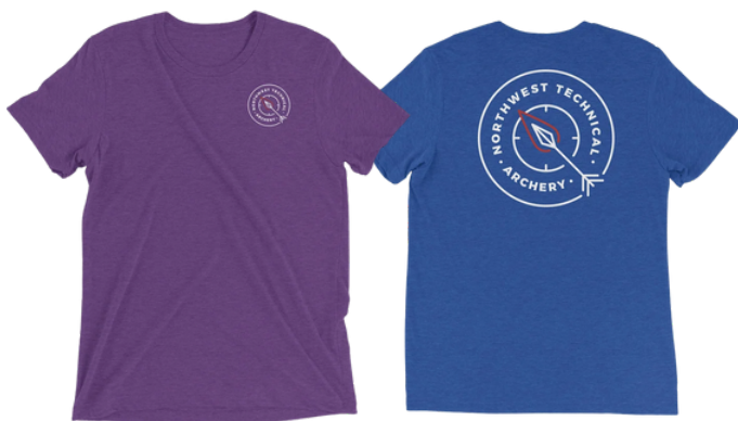
12 colors available

Jerseys are custom and must be ordered through your coaches. Jerseys incorporate Mt. Rainier and the WA state flag. There's an optional line for pronouns, or anything you'd like to put there. One printed jersey should be available for viewing mid October. Orders will be placed shortly after so jerseys can arrive before AWC in December. Details TBA. Jersey cost $45-75 depending on size of the order. The collar will differ slightly from the mock up pictured. Jersey colors: royal blue, purple, green, black/gray, orange, and crimson.